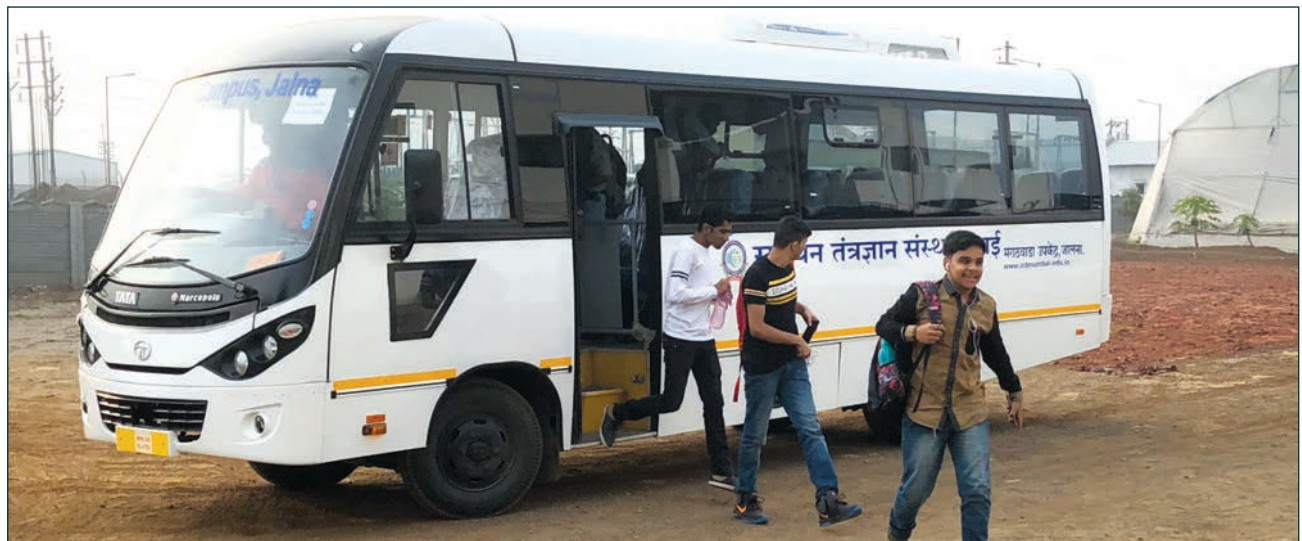
▼ New bus