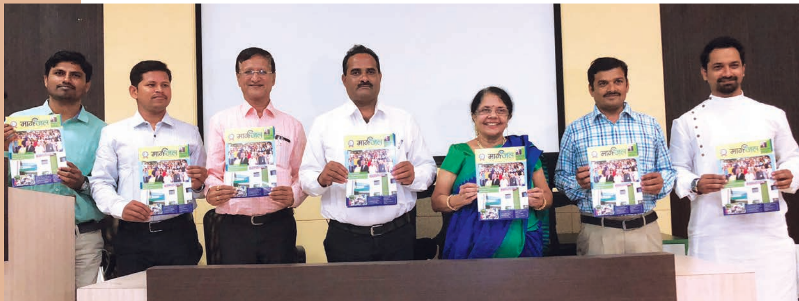
▲ Release of 1 st issue of MargJal at Jalna campus