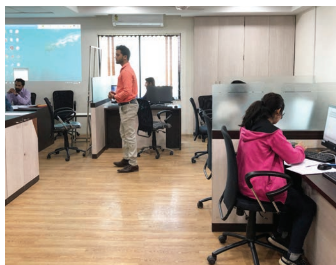
▲ Computer examination in the computer lab