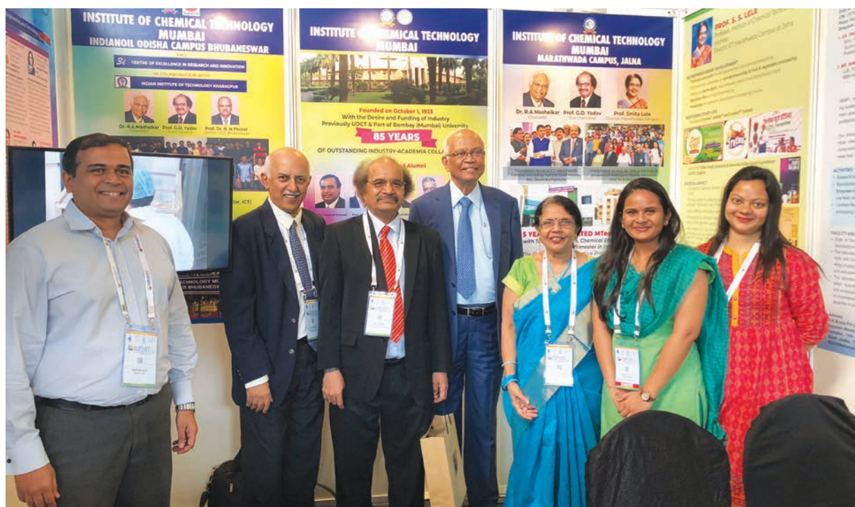
▲ Team ICT at the IUFoST start-up stall